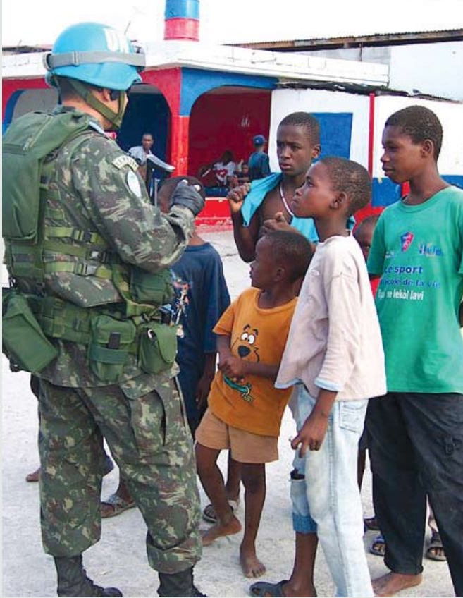
Members of the UN peacekeeping forces are a familiar sight in the day-to-day lives of the children of Haiti.

Americans know so very little about it. Many are surprised to learn, for example, that Haiti was the second independent state in the Western Hemisphere and the first free Black republic in the world.