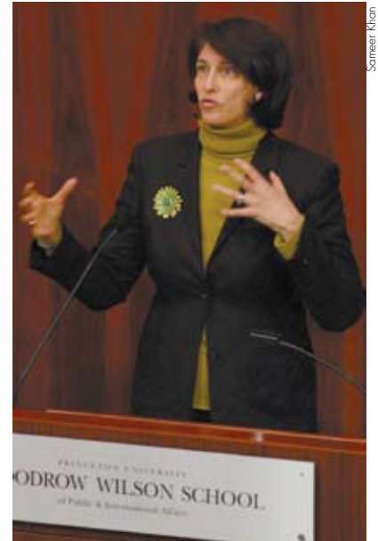
Mara Liasson, national political correspondent for National Public Radio

She has no definitive answers for the audience, but like her, many undecided voters are grappling with these questions. However, she is sure of one thing: "This is the most exciting election of my career." And no matter which way you look at it, no matter who wins, change is coming to the White House. ■■■