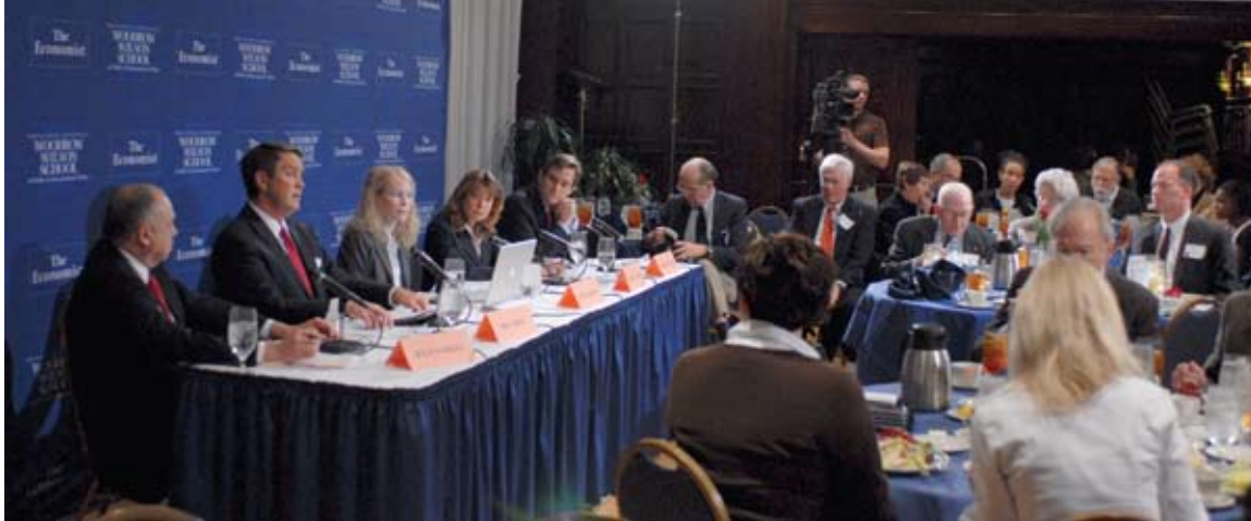
Carried live on C-SPAN television, panelists debated policy options to mitigate the crisis in Darfur, particularly in regard to China's role.

Guest expressed that there needs to be more pressure against the reigning powers and more involvement by the U.S. and the UN Security Council. In addition, he asserted that the Chinese need to be shamed into pulling their weight on the Security Council, and that there be vigorous investigation and prosecution of war crimes and heightened peacekeeping efforts.