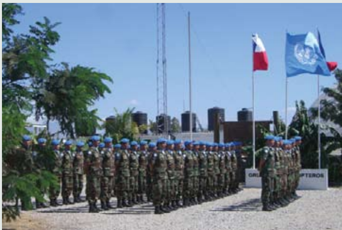
Training session of the UN peacekeeping forces, also known as the “blue helmets,” in Haiti.

Our class left Haiti overwhelmed by all that we had seen and heard in such a short time. In the silence on the bus ride to Toussaint Louverture Airport in Port-au-Prince, we drove through a market bustling with women buying fruit and children playing on the sidewalks. While we knew that our time in Haiti would remain indelibly remain engraved in our minds, we wondered about the Haitian official’s earlier question. Now that we had come to witness Haiti’s struggle, what would we do now that we had seen it? As a beginning to what we hope will be a much larger effort “to take Haiti back with us,” we share this story with you, and with all those who will hear it. ■■■