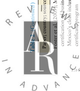
Table 2 (Continued)