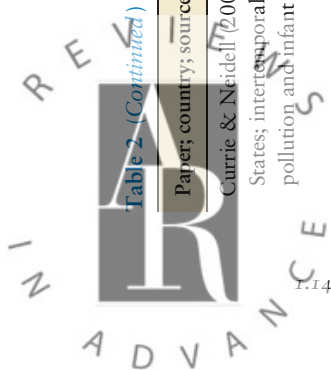
Table 2 (Continued)