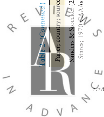
Table 2 (Continued)